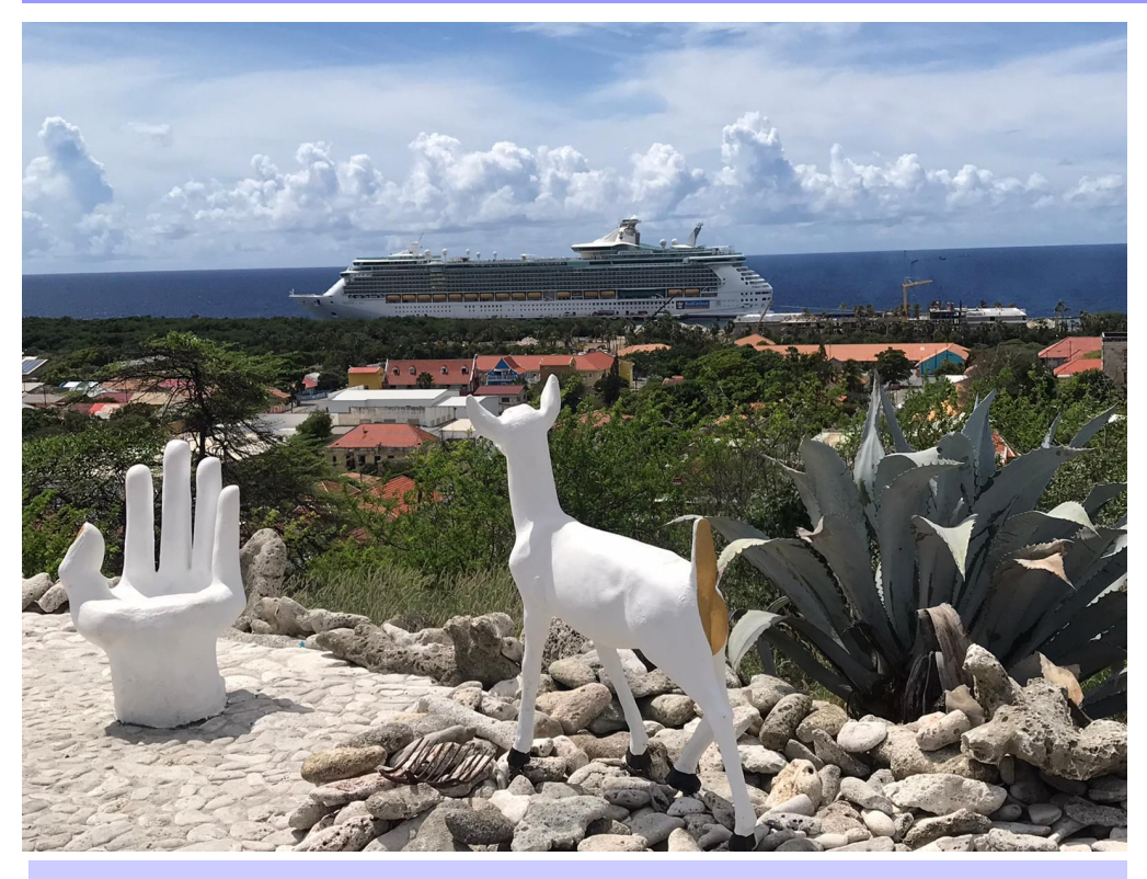
This new mirador is at Seru di Domi

Our island combines all: nationalities, language, culture.